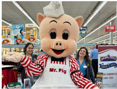
Saraland Chamber of Commerce Business Expo

Our Marketing & Human Resources teams were excited to attend several events in the Mobile Area to speak with members and potential members in our community about NHCU!