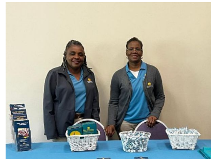
Spring Hill College Career Fair